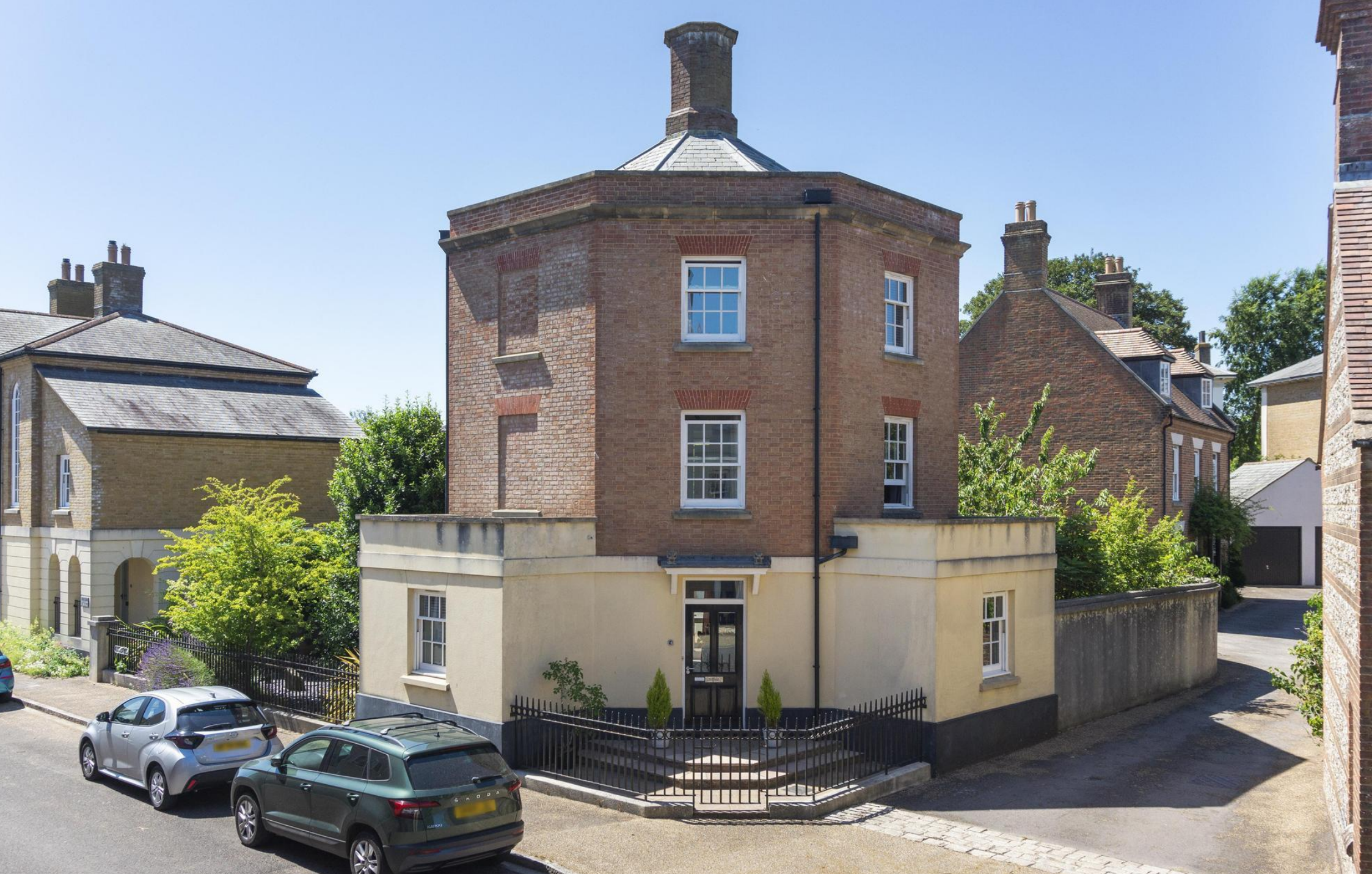
Moraston Street Poundbury